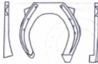
French Hind 11 x 3/8 x 1 General Heel Calk Swelled Medial Heel 3/4 Fullered Maselottes at Quarters 7 Nails, 4E Slim