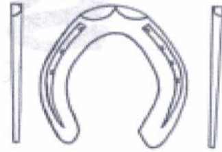
Graduated Diamond Toe 11 x 3/8 x 1 3/4 Fullered 7 Nails, 5E slim