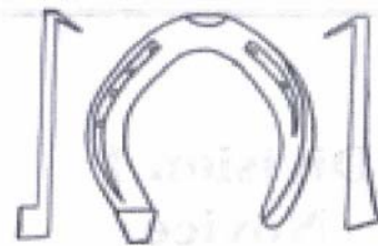
Calk and Feather 12 x 3/8 x 3/4, 3/4 Fullered 6 Nails, 4E, Toe Clip Calk and Feather Heels